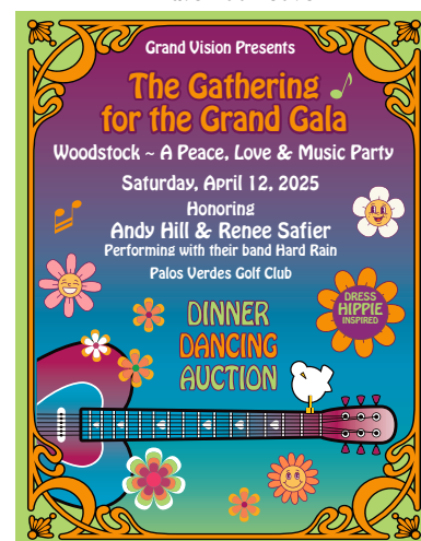
Tribute book cover

*Message for small/well wish page ad: _____ _____ _____ _____